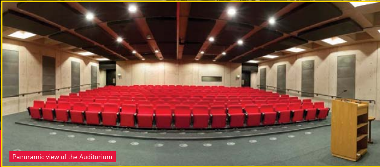
Panoramic view of the Auditorium

The National Cold War Exhibition Auditorium