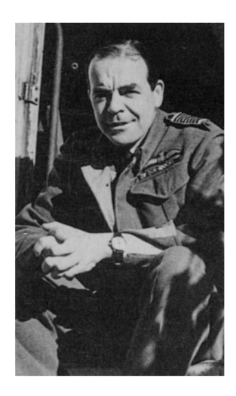
Acting Air Commodore Harry Broadhurst