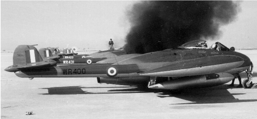
Characteristic smoky start up of an Eastleigh-based Venom FB 4 of No 208 Sqn.

more Venoms were available. Although FEAF's squadrons still needed to be maintained, more than half of the 150 FB 4s built had been delivered directly to the Middle East and the survivors of these, plus a few hand-me-downs from the disbanded Wunstorf Wing, provided ample stocks from which to sustain No 8 Sqn until a replacement type could be obtained. Interestingly, at least sixty-five FB 4s were on charge to No 8 Sqn at one time or another. To take advantage of the kinder climate, some of the surplus Venoms were held at Eastleigh where, from early 1959, No 142 Sqn was established to fly some of them, although this unit had become No 208 Sqn before the end of the year.