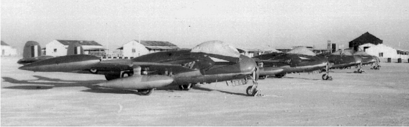
Four of No 8 Sqn's Venom FB 4s photographed shortly after their arrival at Sharjah on 29th December 1958.

Some British troops with armoured cars were sent up from Aden. With airborne fire support these combined forces overcame the opposition and restored control. But the rebel leaders, with a sizeable force of their followers, escaped up into the stronghold of the Jebel, still determined to find ways of challenging the rightful Government.