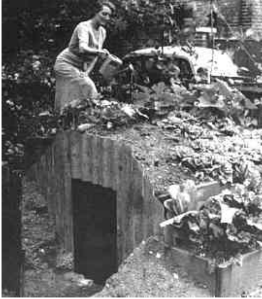
Anderson Shelter, the soil on top of the shelter is being used to grow vegetables as part of the Dig for Victory campaign.