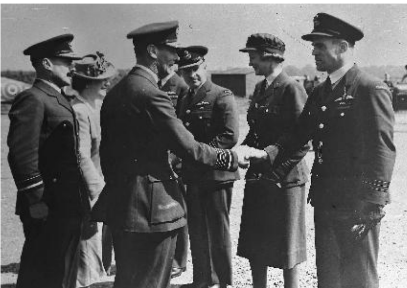
Senior RAF personnel at RAF Digby, 1945 shaking hands with King George VI. King George VI is wearing the Marshal of the RAF uniform.