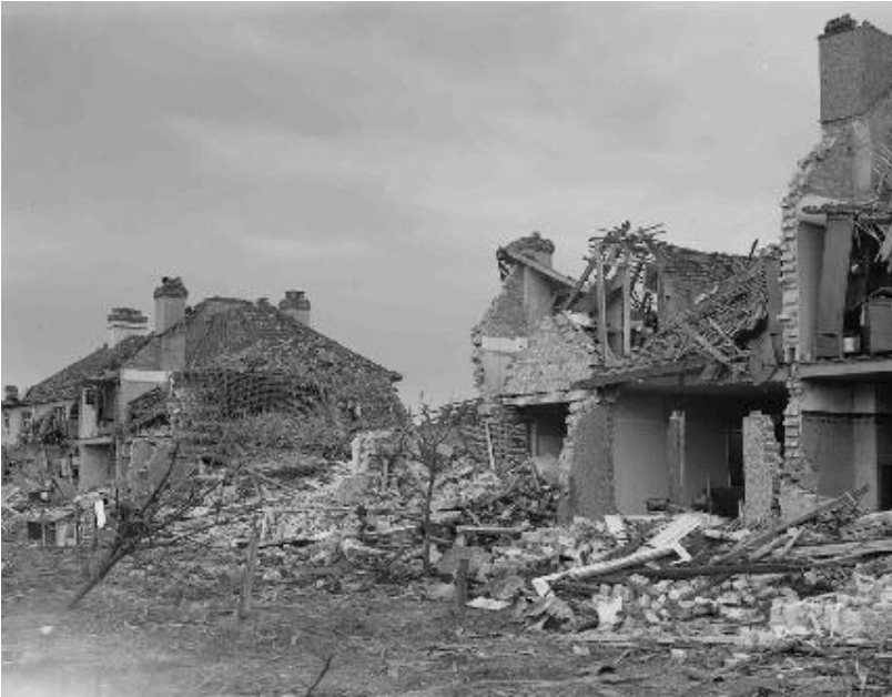
Result of a German flying bomb attack on a row of semi detached houses.