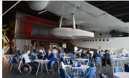
Hangar 1 Café