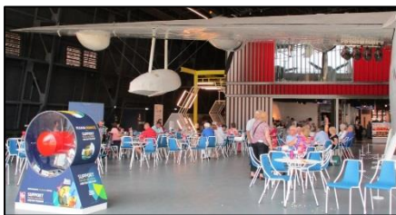
Hangar 1 café

You can bring a packed lunch which you can eat in the indoor picnic area in Hangar 4, although this area can get very busy and is often noisy. If the weather is nice you can eat at the outdoor picnic area which can be found on the grassy space in the middle of the Museum site. Food and drink may not be consumed in the rest of the Museum.