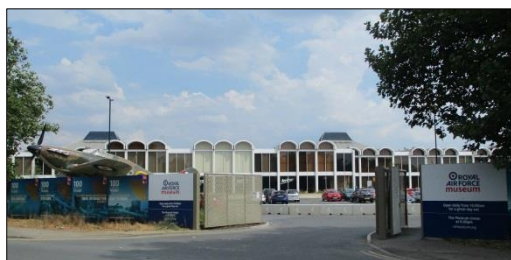
The Museum car park entrance

There are two entrances to the Royal Air Force Museum site, one for cars and one for pedestrians. Both entrances are located on Grahame Park Way.