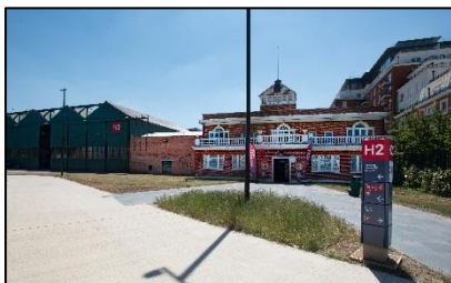
Hangar 2 (H2)

Hangar 2 houses our First World War collections and tells the story of the men and women who brought aviation to the fore. There are interactives that you can try and stunning audio-visual displays with sound effects and narrative. You can view much of the exhibition from the balcony on the upper level.