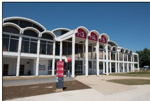
Hangars 3,4 and 5 (H3, H4 and H5)

In this building you will also find the Art Gallery and the 4D Theatre.