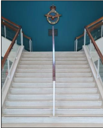
Stairs to the Art Gallery

The Art Gallery can be found upstairs in Hangar 3. Take the stairs opposite the hangar entrance and turn right for the Art Gallery.