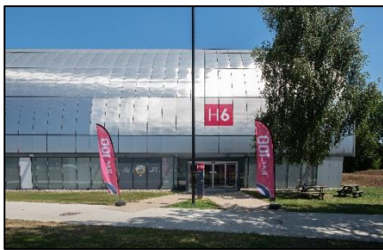
Hangar 6 (H6)

Hangar 6 is home to another exhibition called 'The RAF in an Age of Uncertainty'. The Learning Centre is also in this building.