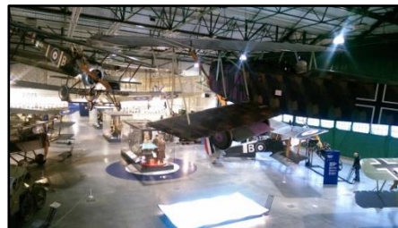
The view from the balcony

Hangars 3, 4 and 5 are all in the same building. Hangars 3 and 4 contain our collection of helicopters, along with aeroplanes and other vehicles. Hangar 5 contains the larger bomber aircraft. When you arrive at the Avro Lancaster, there is a slope up in to the hangar.