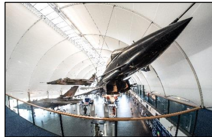
The RAF in an Age of Uncertainty

Further information on the Museum and its collections can be found on the Museum website www.rafmuseum.org.uk .