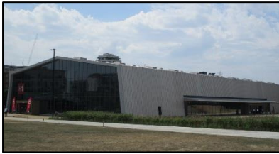
Hangar 1 (H1)

Hangar 1 is home to two exhibitions – RAF Stories and RAF: First to the Future. The Museum Shop and café are also in this hangar and there are lots of interactives which you can try.