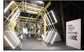
RAF: First to the Future

Hangar 2 houses our First World War collections and tells the story of the men and women who brought aviation to the fore. There are interactives that you can try and stunning audio-visual displays with sound effects and narrative. You can view much of the exhibition from the balcony on the upper level.