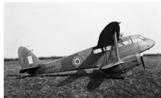
De Havilland Dominie Mk II