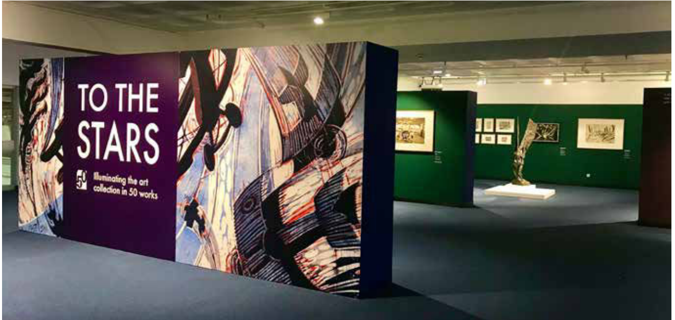
The RAF Museum London Art Gallery