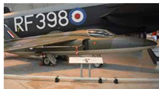
Folland Gnat F.1