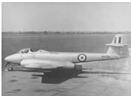
Gloster Meteor T.7mod