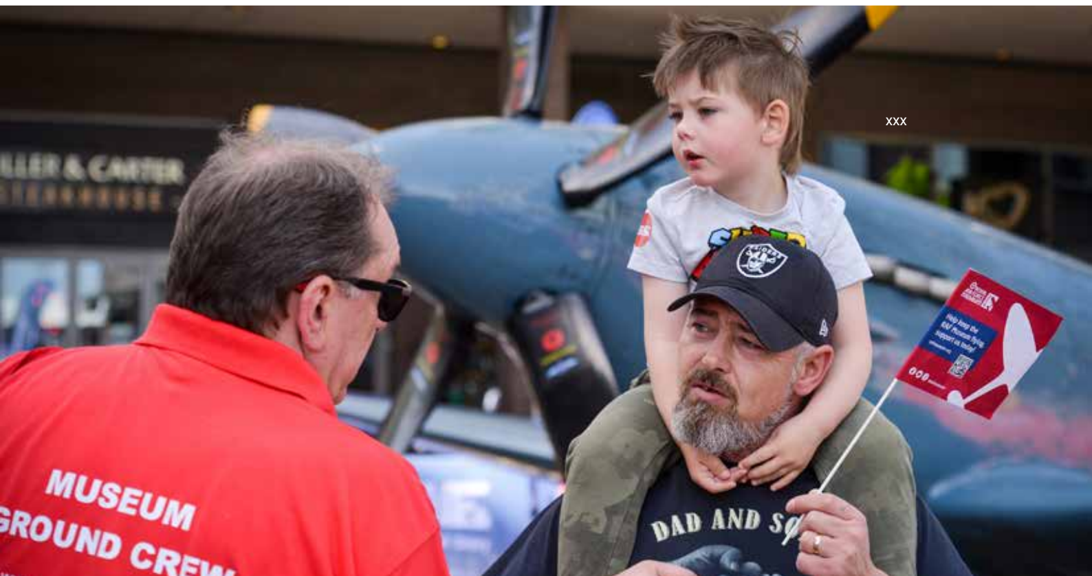
The Museums Spitfire tour across the Midlands attracted huge crowds