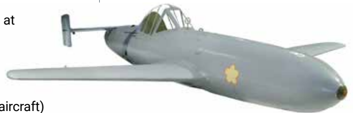
Yokosuka MXY7 Ohka - 65/O/879