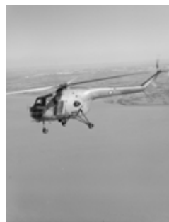
Bristol Sycamore HR. 14