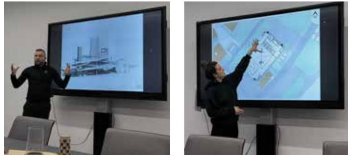
Students from the University of Wolverhampton present their designs to the Project Team

An exhibition of their work included their 2D plans, 3D models and a short film giving their thoughts on the project.