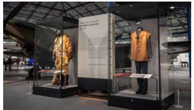
Uniforms on display in our new Bomber Command exhibition

A Second World War Vickers Wellington bomber, one of only two remaining, has been restored to its former glory after more than a decade of conservation at the RAFM Midlands. The exhibition marks the 80th anniversary of the 'Dambusters' raid. New displays explore the complex Bomber Command story in an interactive and engaging way.