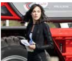
Gal Gadot filming 'Heart of Stone' at our Midlands site

Fans of Strictly Come Dancing may have spotted Strictly Come Dancing filming Matt Goss in the Buccaneer at Hangar 6 - just one of several filming and corporate events we were able to host.