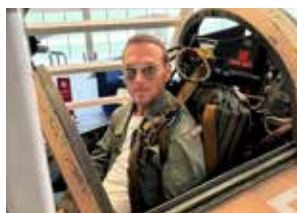
Matt Goss at London