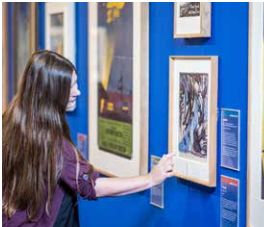
The exhibition was a chance to share some hidden gems