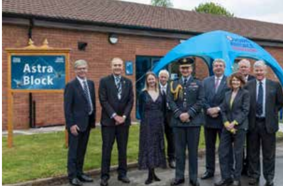
The new Astra Training accommodation block

The Museum's property assets are revalued on a quinquennial (five-year) basis. A revaluation of both the freehold (London) and leasehold (Cosford and Stafford) properties as at 31 March 2023, have seen a total adjustment for recognised gains of £17,095,000. These are reflected in the year-end accounts.