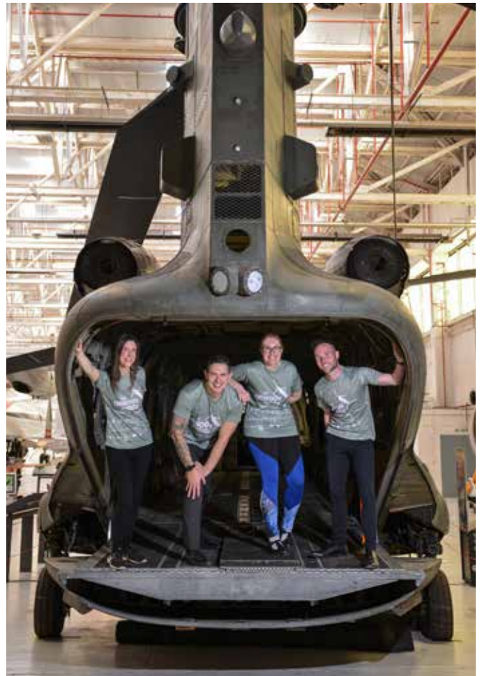
Participants at the Chinook Challenge