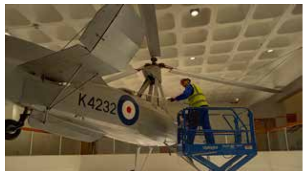
The Avro Rota is now suspended from the ceiling of our Hangar 3 entrance in London