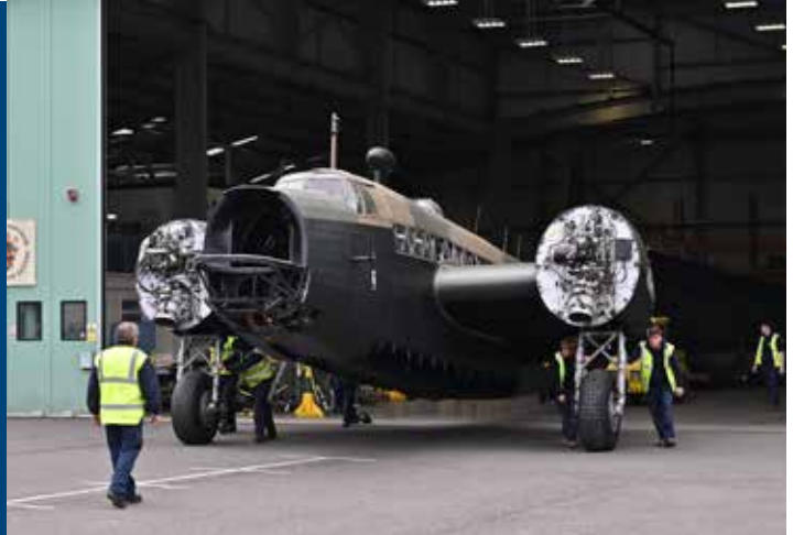
RAF Museum Apprentices assist with the Wellington move