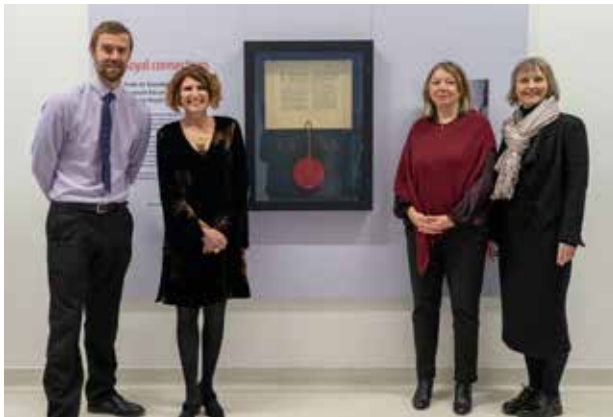
Members of the Museum's Senior Leadership Team at the Royal Charter unveiling

Her Late Majesty Queen Elizabeth II had granted our petition for a Royal Charter. On 1 April 2022, following a Transfer of Deeds, we moved from being an unincorporated charity to a new incorporated charity of the same name with Royal Charter status.