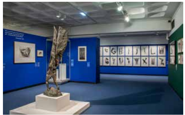
Fiona Banner's artwork on display in our London gallery