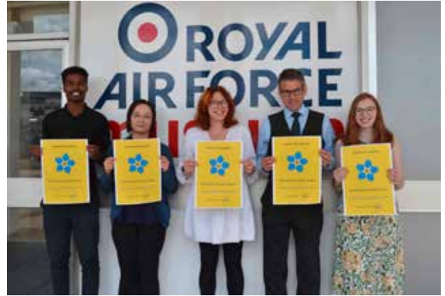
Staff at London celebrate our accreditation as a Dementia Friendly Venue