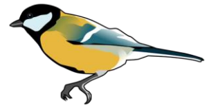
Blue Tit or Great Tit