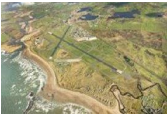
RAF Valley, Wales Copyright

...but because aircraft need loads of open space, there is also plenty of undisturbed land for insects, birds and mammals to call home.