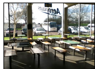
Wessex Café and the indoor picnic area