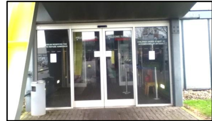
The Visitor Entrance