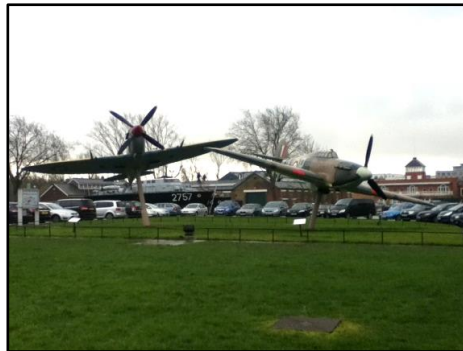
Our reproduction Spitfire and Hurricane

Should an alarm sound, follow the instructions and make your way through any exit door. The meeting point during a fire alarm is by the reproduction Spitfire and Hurricane in the car park.