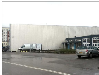
The Battle of Britain Hall from the car park

The Battle of Britain Hall is in a separate building and to access this you will need to exit Historic Hangars and cross the car park. There is a pedestrian crossing to help you do this safely. As you walk to this building you will see our reproduction Spitfire and Hurricane.