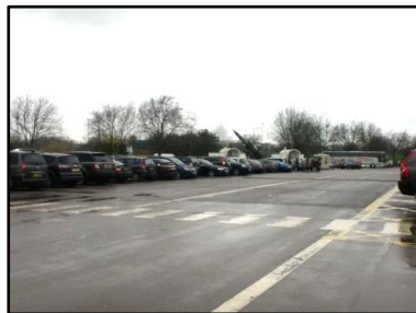
The Museum Car Park

There is a car park charge of £3.00 for 3 hours and £4.00 for up to 6 hours. You will find pay and display machines located around the car park.