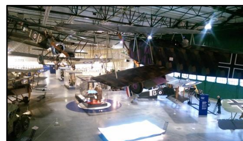
The view from the balcony

Further information on the Museum and its collections can be found on the Museum website www.rafmuseum.org.uk .