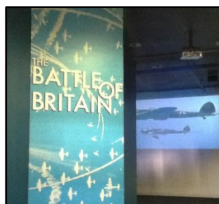
The Battle of Britain Hall

In the Battle of Britain Hall you will find scenes depicting life during the Second World War, with aircraft from the same period. There is a light and sound show that runs on the hour every hour from 11:00 and which lasts for approximately 15 minutes. When the show is running the hall is dark as the lights have to be dimmed.