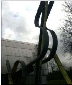
The yellow sculpture

If you are visiting the Museum to look around please make your way to the visitor entrance. Look for the yellow sculpture and the entrance is underneath it. There is no admission charge, but if you would like to purchase a guide book you can do so at the reception desk. If you have a bag a member of security staff may ask to look inside it.