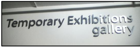
Temporary Exhibitions Gallery

The Art Gallery and Temporary Exhibitions Gallery can be found above the Conference Reception. Take the stairs and turn left for the Temporary Exhibitions Gallery and/or right for the Art Gallery.