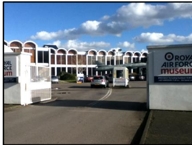
Car Park entrance

There are two entrances to the Royal Air Force Museum. There is an entrance to the car park and a pedestrian entrance. Both are located on Grahame Park Way.