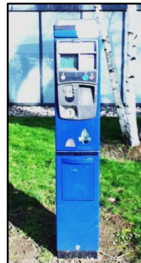
Pay and display machine