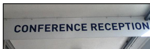
The Conference Entrance

There are two entrances to the Museum; The Conference reception and the Visitor entrance. If you are visiting the Museum on business or for a work meeting please make your way to Conference Reception where a member of staff will assist you.