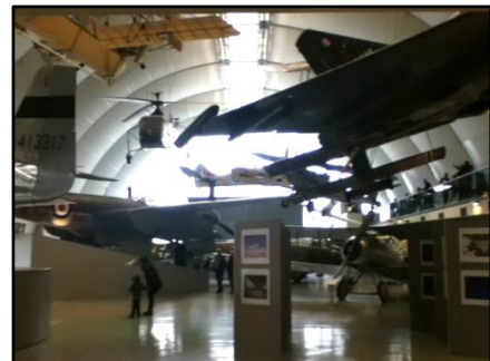
The Milestones of Flight Hall