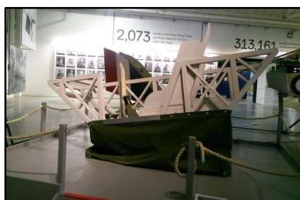
Some of our interactives