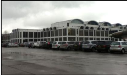
The Bomber Hall and Historic Hangars from the car park

The next hall is the Bomber Hall . You will need to go through the double doors and along the poly-tunnel to enter it. This hall contains the larger Bomber aircraft. The Bomber hall is not as brightly lit as the previous hall. When you arrive at the Avro Lancaster, the hall opens out to the Historic Hangars, and this is the next area to visit once you have looked around Bomber hall.