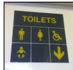
Examples of signage