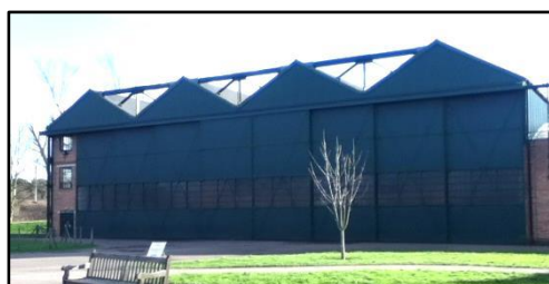
Grahame-White Watch Office and Factory