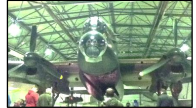
The Avro Lancaster

Historic Hangars contains our collection of helicopters, along with aircraft and vehicles. In this hall you will also find the Wessex Café, the 4D Theatre, the shop, the exit to the car park and the entrance to Aeronauts Interactive Gallery.