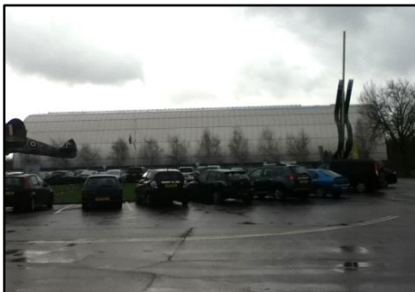
The Milestones of Flight Hall from the car park

Your visit starts in the Milestones of Flight Hall . This hall contains aircraft from different ages, from the very early to the most recent. There are a number of levels that you can access to allow you to view the aircraft. Along one of the walls is a 'Timeline' which charts the progress in aircraft technology, along with important events in history. It starts from 1903, the year that the first flight was undertaken by the Wright brothers, up to 2003 when the Milestones of Flight Hall opened.