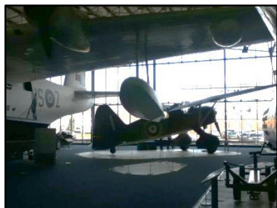
The Sunderland Hall

Walking through the Sunderland is not recommended if you do not like confined spaces.