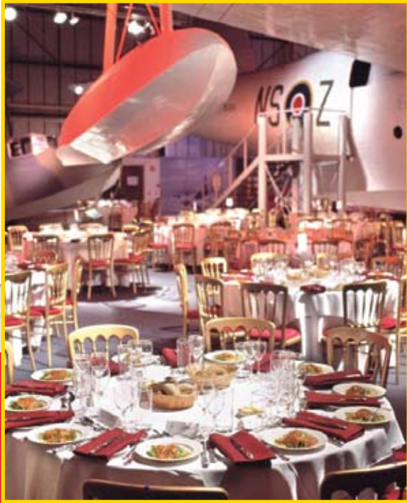
Catering by digby trout Restaurants

Imagine guests arriving for a nostalgic walk through 'London in the Blitz' and 'Our Finest Hour' before enjoying a drinks reception beneath the historic Spitfire and Hurricane. Dinner will then be served beneath the wings of the magnificent Sunderland Flying Boat, seating up to 150 people for a dinner or 100 for a dinner dance.