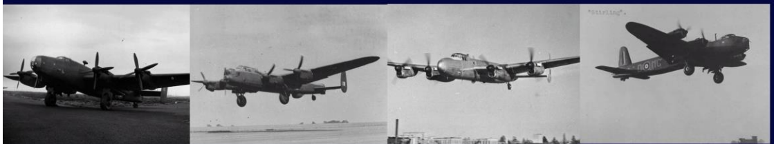
Handley Page Halifax (All variants)