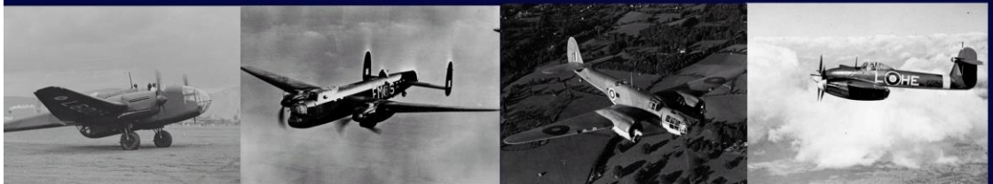
Handley Page Hereford