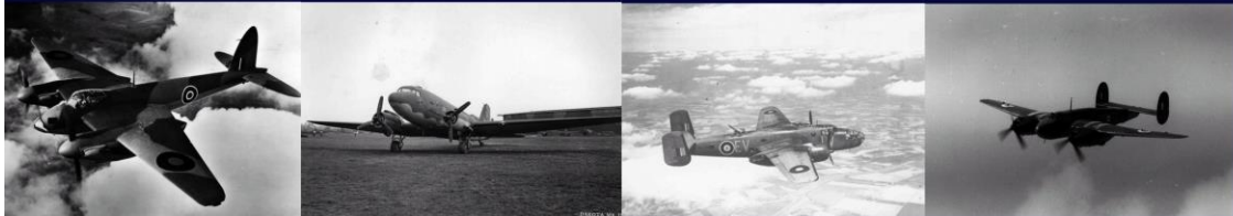
de Havilland Mosquito (All variants)