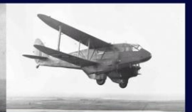
de Havilland Dominie